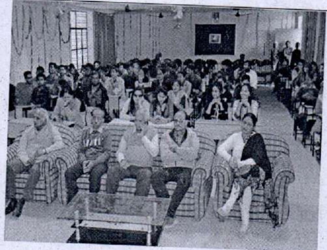
Figure 2 Debate Competition on Freedom Fighters, 29/8/2019